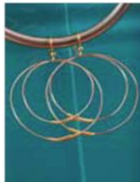
I928 Rose Hoop

Copper kidney earwire. Etched nickel teardrop, hammered brass teardrop. Length: 1 1/4"