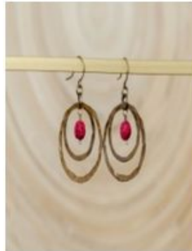
I826 Juniper (New)

Rose gold earwire with etched and colored copper. Length: 2"