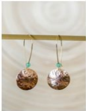
I828 Verbena (New)

Silver plated earwire with etched nickel charm. Inked patina. Colors vary. Length: 1 1/2"