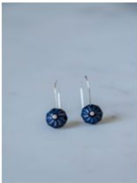
I733 Rosebud (New)

Silver-plated post earwire with nickel oval charm. Length: 1"