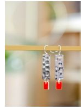
I824 Cookies and Cream

Silver-plated earwire. Studio etched nickel triangle studio inked patina. Colors vary. Length 1 1/2"