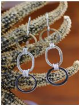
I722 Tri Metal

Antique Brass earwire. Copper etched and fired charm. Colors vary. Length: 2 1/4"