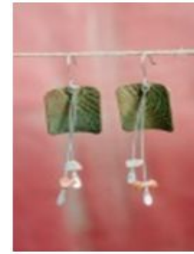
I933 Mimosa Sunrise

Gold-plated earwire. Curved copper strip with gold ring. Length: 1 1/2"