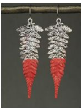
I1209 Butter Pecan

Silver-plated earwire. Handmade nickel silver, brass and studio etched copper charms. Length: 2 1/2"