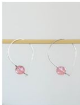
I829 Orchid (New)

Gold-plated kidney earwire with textured bronze. Gemstone beads. Colors vary. Length: 2 1/4"