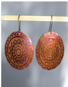
I1224 Lotus (New)