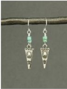
I730 Mint Chip

Etched and patinated copper pendant. Brass earwire. Length: 2"