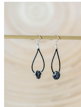
I1226 Sorrel (New)

Silver filled, hammered and shaped wire. Length: 1 1/2"