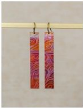
I721 Ivy (New)