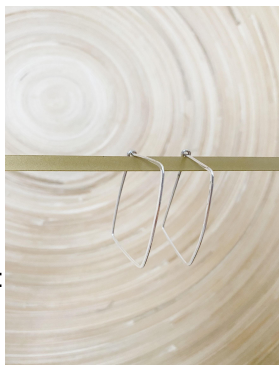
I1225 Dahlia (New)

Antique brass earwire with etched and flame painted copper. Colors vary. Length: 2 1/4"