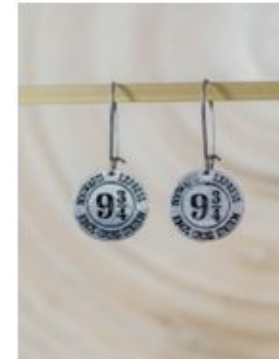
I731 Sticky Toffee Pudding

Silver-plated earwire, gemstone beads, pewter charm. Colors vary. Length: 2"