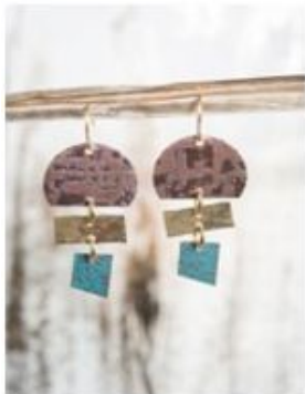
I1030 Sturgeon Bay

Antique brass earwire. Enameled copper rectangle, antique brass headpin, glass round bead. Colors vary. Length: 1 3/4"