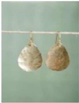
I820 Patron Gold