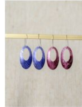
I827 Lilac (New)

Antique brass earwire with hammered brass charms. Lava rock bead. Colors vary. Length: 1 1/2"