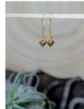
I1032 Cherry Garcia

Silver-plated earwire. Enameled copper charm. Colors vary. Length: 1 3/4"