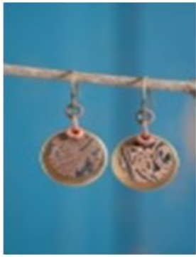
I931 Bronze Age