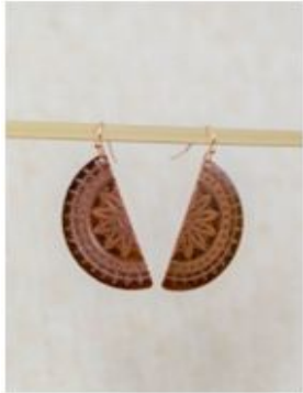
I825 Aster (New)

Silver-plated earwire and components. Studio hammered nickel and resin charms. Colors vary. Length: 1 3/4"