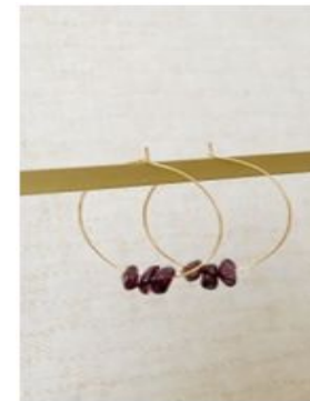
I734 Clover (New)

Silver or gold-plated earwire with glass beads. Colors vary. Length: 1"