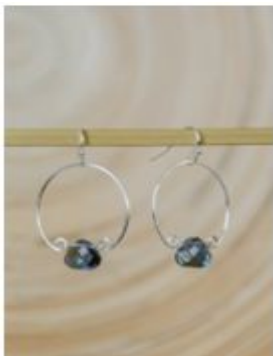
I1135 Blue Bell(New)

Brass earwire. Resin and wood charm. Colors vary. Length: 2 1/2"