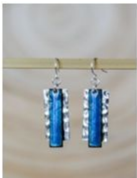
I1033 Cookie Dough

Gold-plated hoop earwire. Brass charms. Length: 1 1/4"