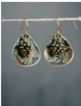
I1131 Nutty Squirrel

Etched and oxidized copper petal-shaped pendant. Antique-copper component and earwire. Length: 2"