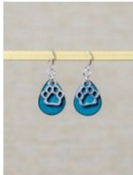
I1031 Moose Tracks

Gold-plated earwire. Etched and patinated copper disc and tag, hammered brass strip. Length: 1 3/4"