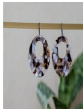
I1133 Chunky Monkey

Gold-plated earwire. Etched and patinated copper spoon with gold-plated pinecone charm. Length: 1 1/4"