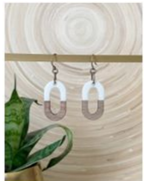
I1134 Half Baked

Niobium earwire. Resin patterned charm. Shapes and colors vary. Length: 2 1/2"