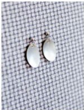
I732 Poppy (New)

Surgical steel kidney earwire. Silver-plated antiqued 9 3/4 charms. Length: 1 3/4"