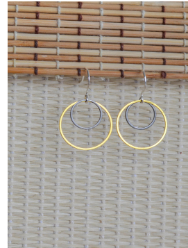
I1035 Salted Carmel

Silver-plated earwire & components. Textured nickel & copper studio enameled charms. Colors vary. Length: 1 1/2"